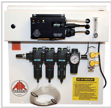
BB30-COPM 30 cfm Steel Panel 48 cfm flow capacity 2 couplings